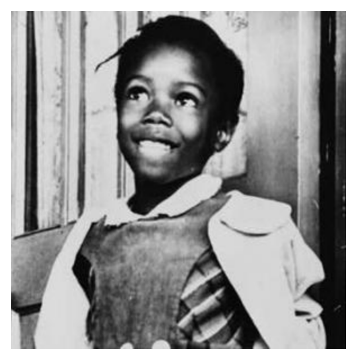
Community Celebrations and Observances